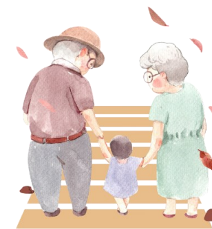
Happy Grandparents Day!