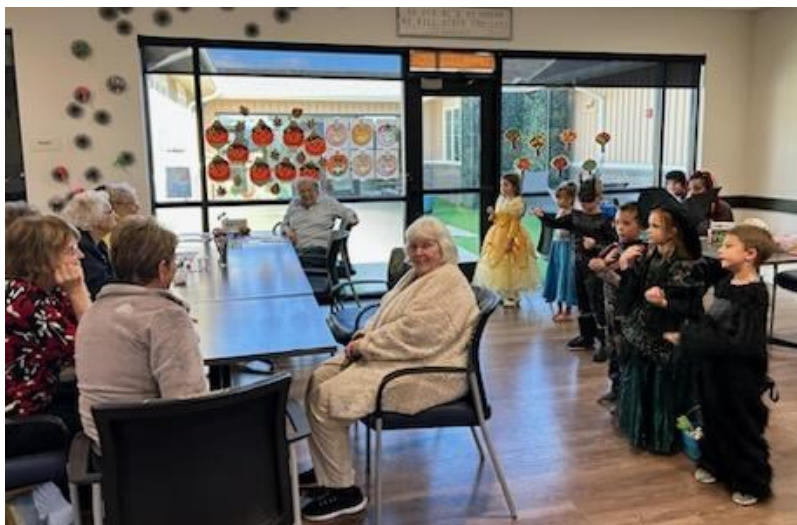
Apollo Elementary students trick-or-treating and showing off their costumes.